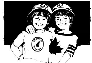
Citizenship in the World Badge

This is a collaborative effort in conjunction with Midcontinent Library. We will be using the expertise of our members to